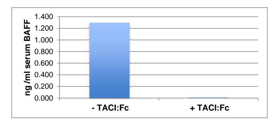
Figure: Specific quantitation of BAFF in human serum.

Detection of BAFF (human) in biological fluids by this ELISA kit is abolished in the presence of a BAFF receptor such as TACI:Fc (AG-40B-0079)