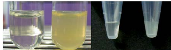
Color sample for chylous sample: 1,000FTU